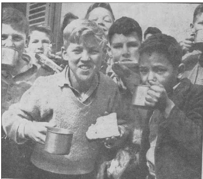
Above: Coffee time - a newspaper photograph from 1954