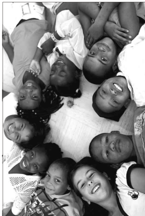
Above: a different angle and Below: back home from school, 2008