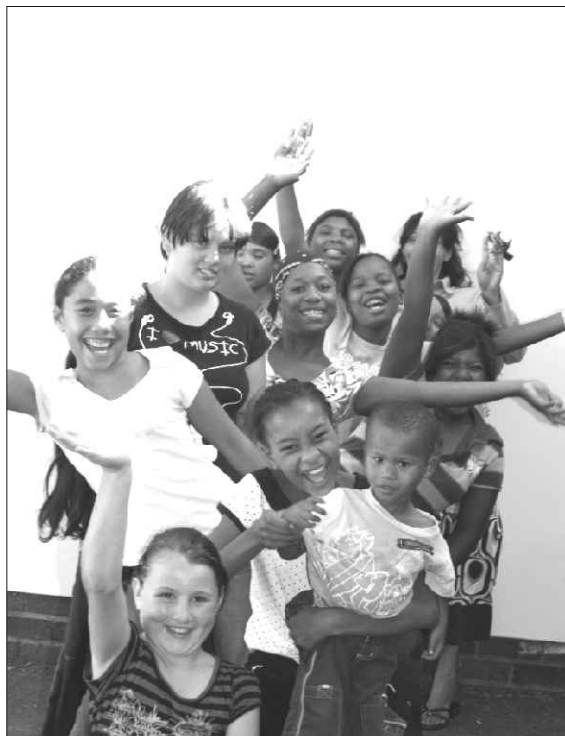
Above: smiling big for the house photo, early 2008

The children were also able to develop in sports, cultural and spiritual areas. Wrestling, netball, athletics and soccer were presented as well as a coffee bar, teen gospel, praise and worship evenings, prayer meetings and a leadership program. A library and a computer centre are manned by volunteers to help the children with their school work.