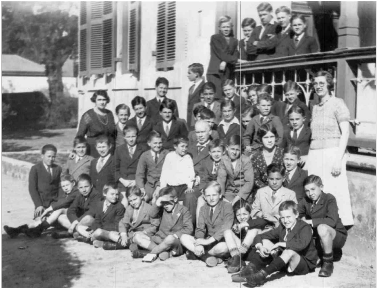
Above. Staff and children in front of the Kinderzendinghuis in Breda Street, Cape Town