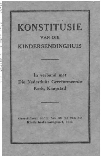
Above: The Constitution

Die reedre deel van die Inrigting gestand en geboue te hies en verk 'n skule of instansie op te stig vir onse doeleinde en sodanige oord als te hies van tyd tot tyd soos veen. 4.—Bestuur. Die Inrigting sal onder leiding en van 'n bestuur bestaande uit tien le aan die Ned. Gerof. Kerk met raad van erwante vakature, en van 'n te hierdie gesel. Die afd. van die bestuur sal ges. 'n voorsitter, sekretar en 'n lid, en elke drie jaar sal 'n nuwe lid word. Die lede sal vore te swore. Die familieaetakinge mag nie die bestuur dien nie. 5.—Sub-kommissie. 'n Sub-kommissie van vier lede die bestuur gekies en daartoe be oopwing van die sekretar, en sal 'n handel en lidde onder die voorsitter of lidde te hies be wende. 'n spesiale verslagende jaarlik. 6.—Huis-kommissie. Vor lede van die bestuur, daart op die huis-kommissie dien.