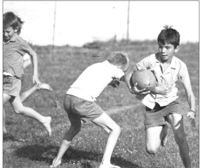
Above: 1893 - in action on the rugby field