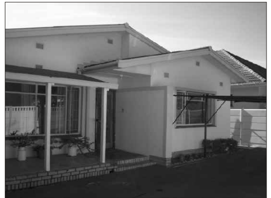
Above: The satellite house and below: