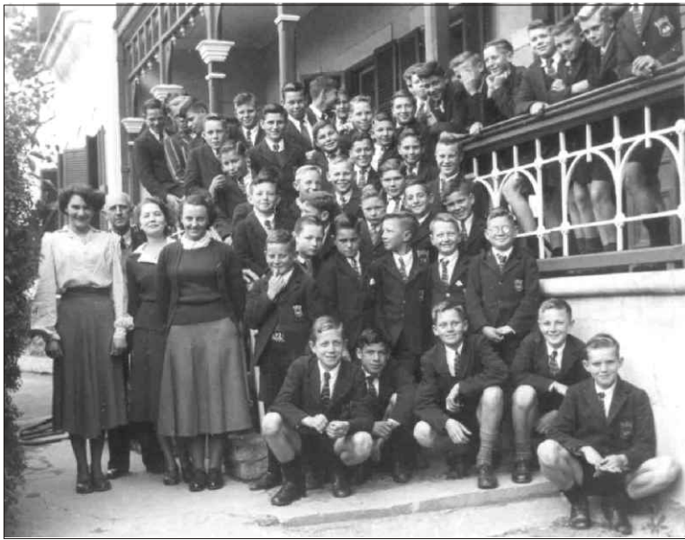
Above: Staff and boys in front of the Kinderzendinghuis, Breda St