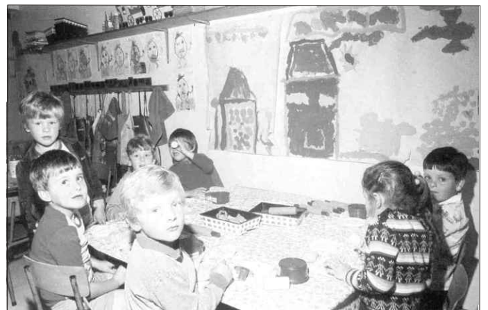
Above: 1983 - toddler activities