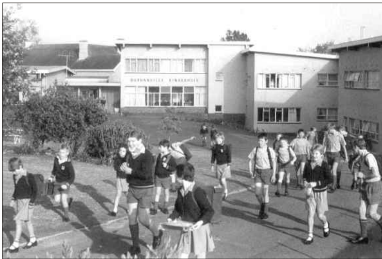
Above: 1983 - on the way to school

During the 1980's the children's home was rebuilt from 'hostel' model to a unit/home model. The children's home was divided into 12 home units and one toddler unit. Every home had its own 'house parents'. This adjustments were made after research was done and the De Meyer Report saw the light. The children's home also had its own pre-primary school called 'Pampoenkraal'.