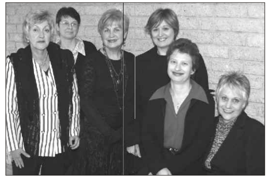
Above: The management team, 2007

The gardens are cared for by Garden Services and cleaning, laundry and food service management are provided by Feedem.