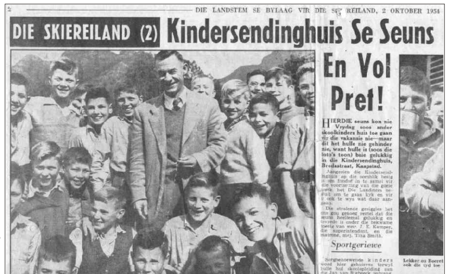
Above: A newspaper article in 'Die Landstem' in 1954