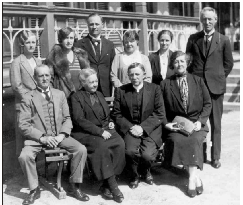
Above: The Management in 1932