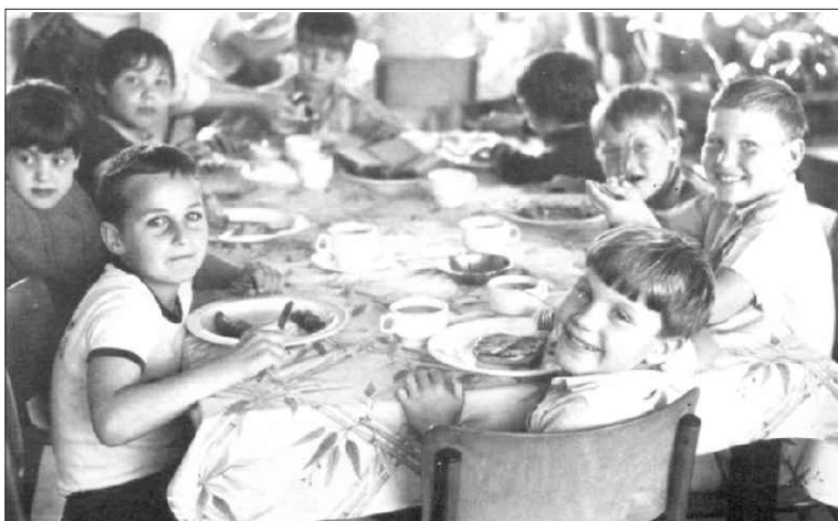
Above: 1983- the children in the dining hall