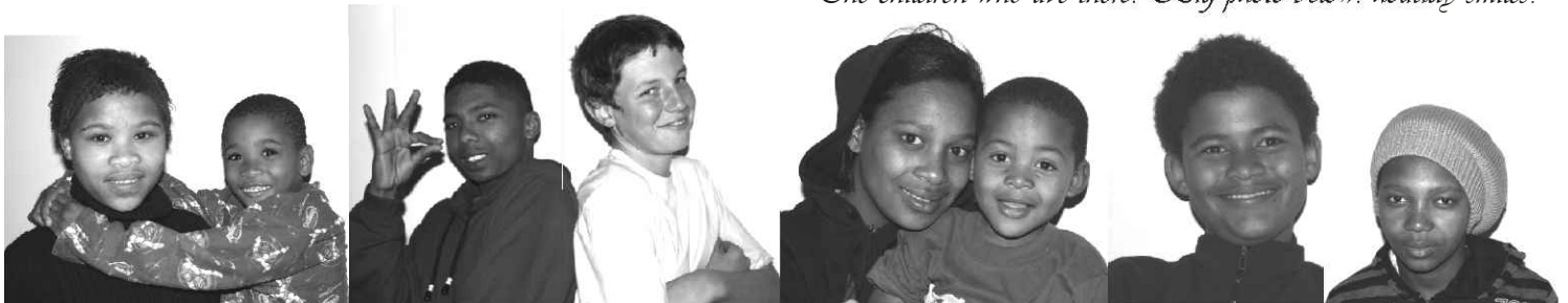
The children who live there. Big photo below: holiday smiles!