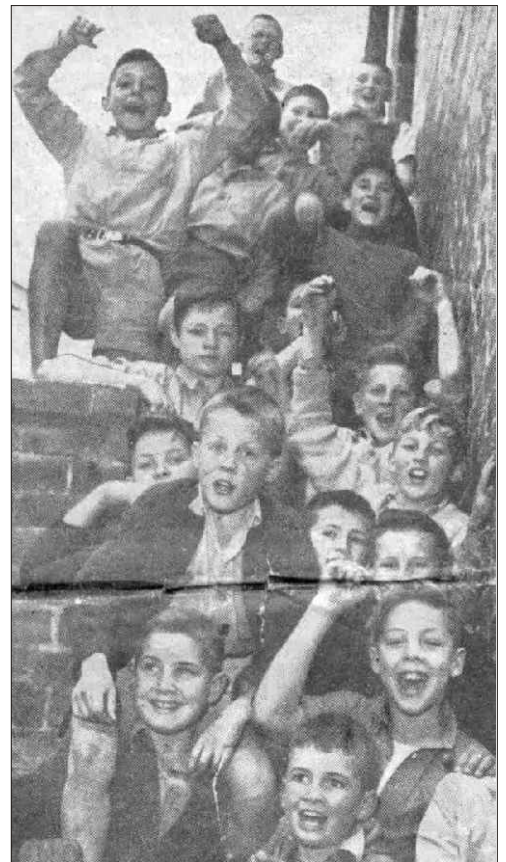
Above. A few mischievous smiles in an article in 'Die Landstem' 1954

And in some instances boys will also be taken in temporarily, until parents or guardians are in the position to care for them again.”