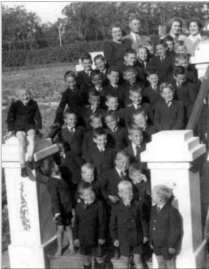
Above: The boys in 1919