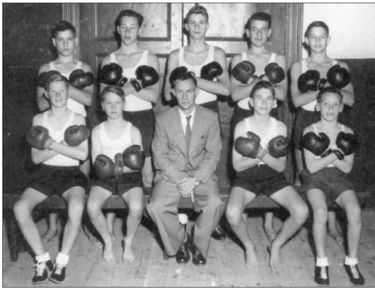
Above: Proud young men in their boxing outfits